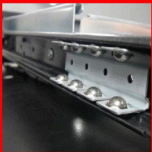
Ball bearing slides