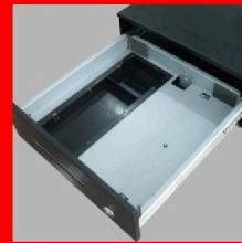
Two floors drawers